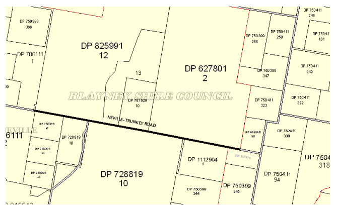
Schedule 4 Roads Authority: Blayney Shire Council Council Ref: RD.RC.4 File Ref:15/09733; W560230

Those parts of the Crown Public roads known as the Neville-Trunkey road as denoted by shading in the diagram below. Width to be transferred: Whole width