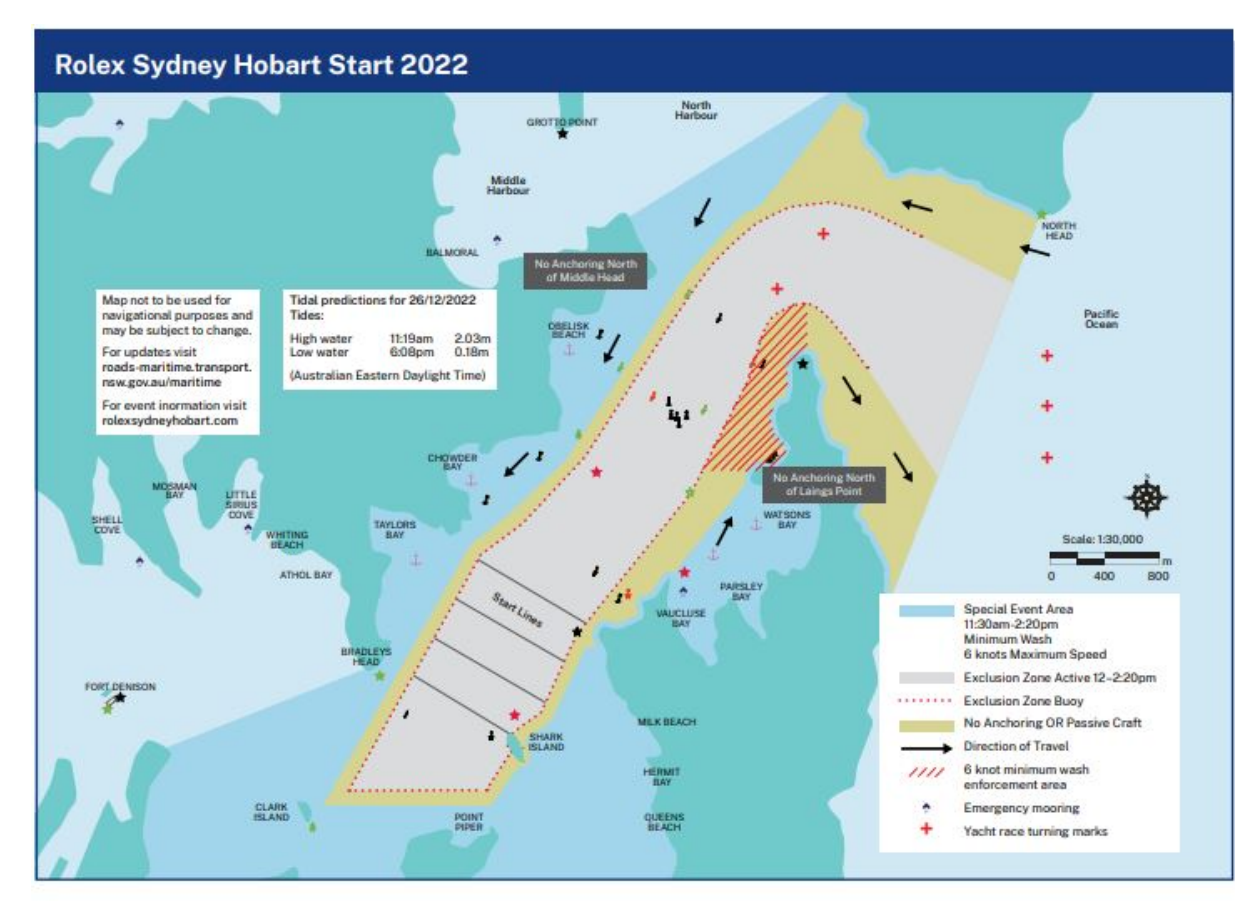
Exclusion zone active 12-2:20pm. Race starts at 1pm