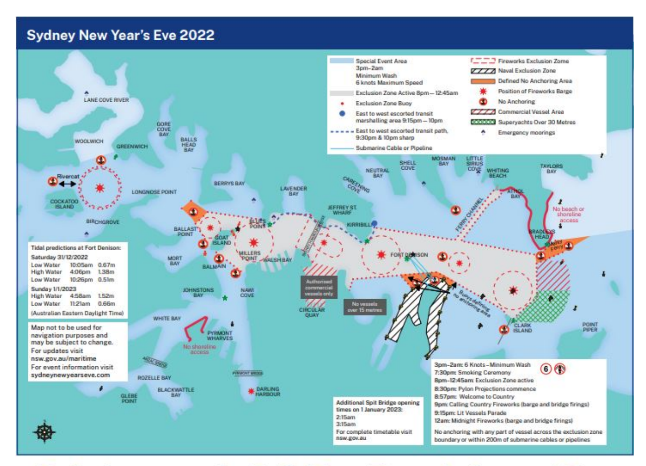
Exclusion zone active 8-12:45pm. Fireworks 9pm and 12am