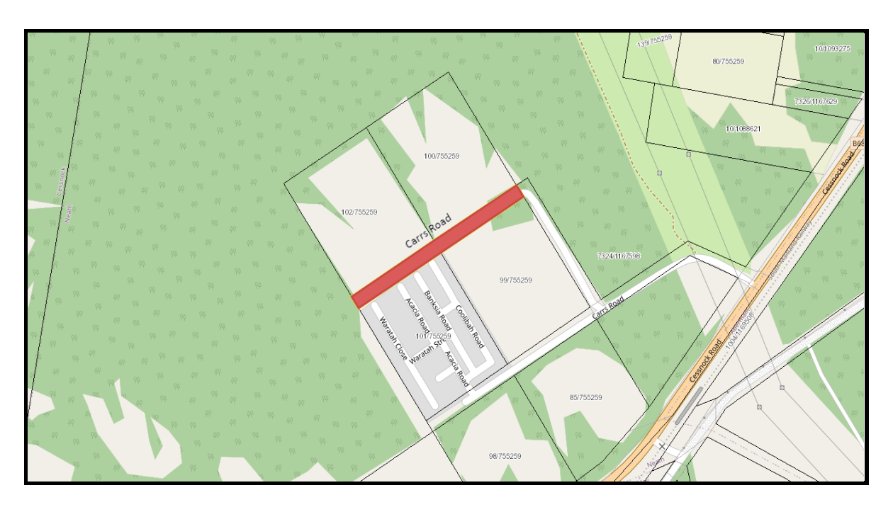
Schedule 2 Roads Authority: Cessnock City Council File Ref: 22/05583

Crown public road at Neath being Carrs Road, extending for approximately 311 metres along the northern boundary of Lot 99 DP 755259 and Lot 101 DP 755259, comprising an area of approximately 6341 m ^2 as highlighted in red on the diagram below.