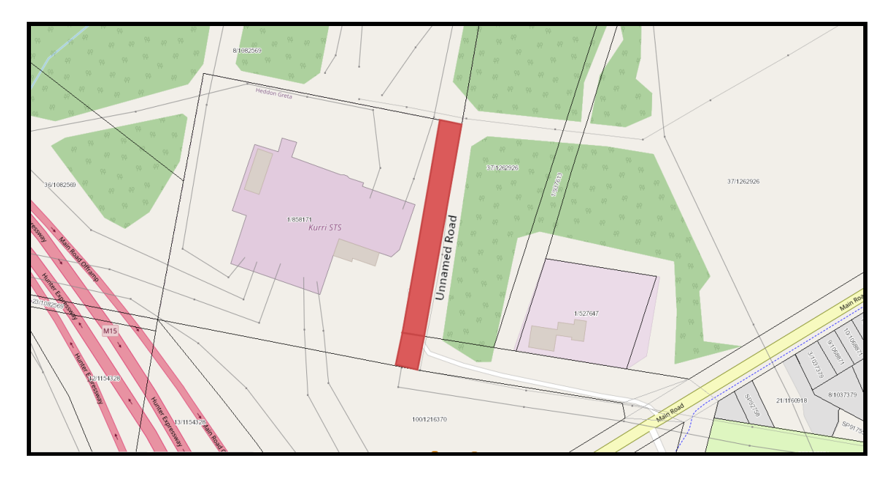
Schedule 2 Roads Authority: Cessnock City Council File Ref: 21/03915#01

Crown public road, being part Unnamed Road off Main Road Heddon Greta, extending 220m and adjacent to the eastern boundary of Lot 1 DP 858171 with an approximate area 1,100m<sup>2</sup> as highlighted red in the diagram below.