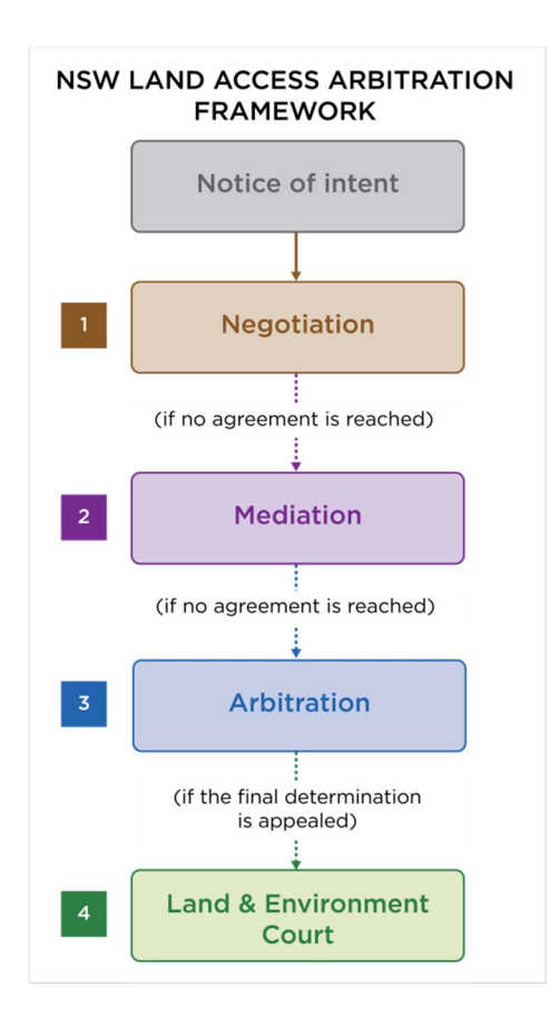
Figure 1. Overview of the land access framework

7.4 A summary of the key legislative provisions is provided in Annexure 1.